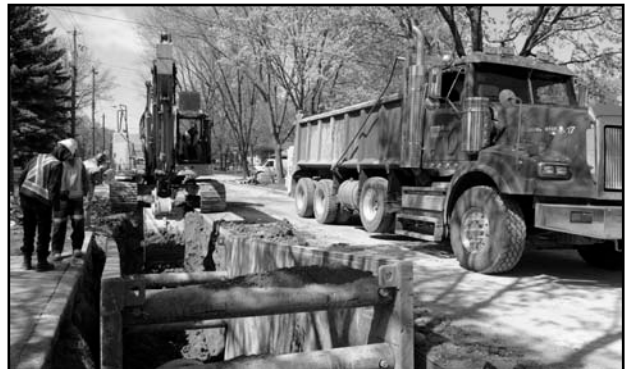
Example open-cut construction in a road

Temporary disruptions to the water supply will occur during the construction period. Further notice will be given prior to any scheduled water supply disruption and residents/businesses will be informed if additional precautions are to be taken during the water supply disruptions.